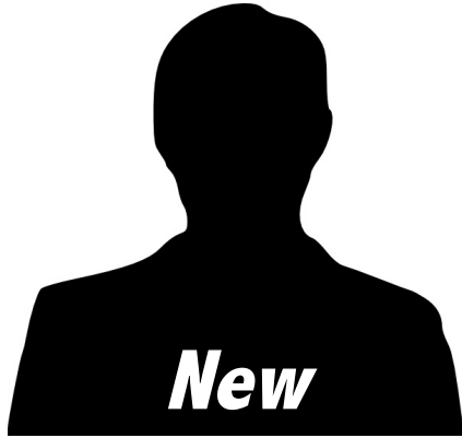
New Cub Master

Parents, please consider volunteering, the boys need you!