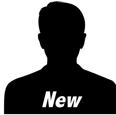
New Service Coordinator