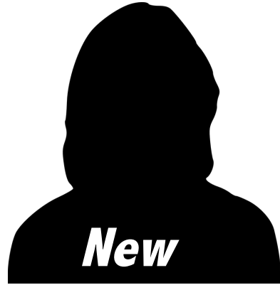
New Recruiting Coordinator